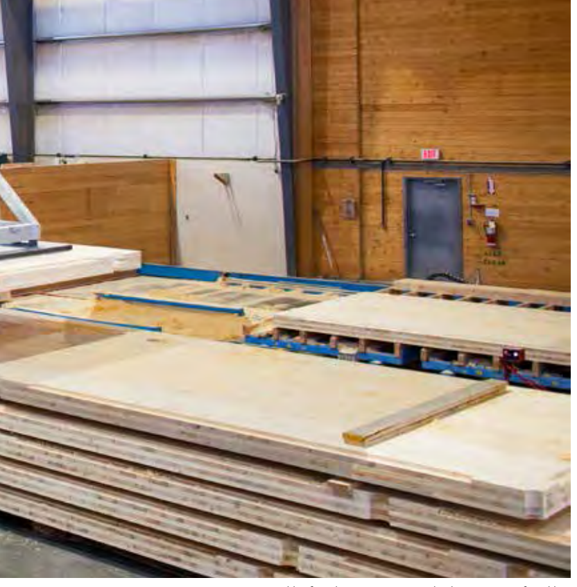
Assembly of Brock Commons CLT panels.