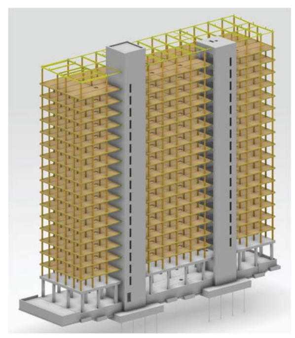
Figure 2: Hybrid structural system