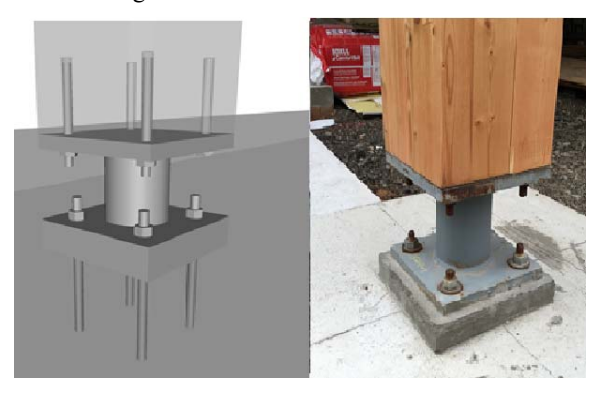
Figure 3: Typical connection ground floor; Left: 3D model, Right: Picture from mock-up

Amongst the key challenges in designing the level 2 slab are the different reaction to lateral loads between the concrete and the wood structures, the precise layout and placement of the anchor bolts for the columns during construction, and the coordination of the mechanical and electrical sleeving through the slab. The connections between the concrete slab and the wood columns are shown in Figure 3.