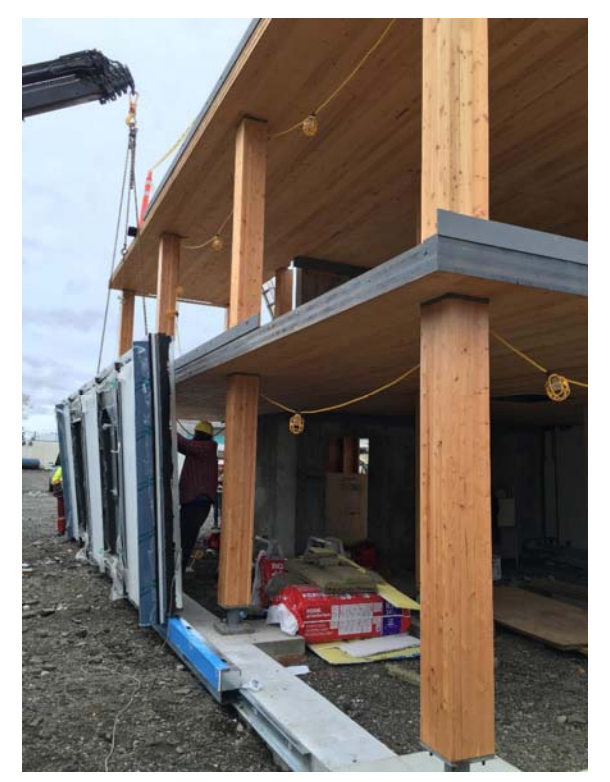
Figure 1: Mock-up

A full scale mock-up was built (see Figure 1) to test the viability and constructability of the designed solutions. The mock-up consisted of a core wall and measured 3 x 3 bays 2 stories high. It was built by the design-assist trades and helped them further refine both their product and the installing process. It was also used to validate the speed of erection for the structure. The mock-up helped the project team validate a number of decisions such as: connection details with column and slab, connection with the slab and concrete core and confirmed the choice of steel assembly for the structural columns. It also allowed the team to make a decision regarding which prefabricated envelope panel they would use on the project [15]. The project team also tested some options for materials and assembly, namely the type of concrete topping as well as the wood sealer to be used during construction. Finally, it allowed the VDC integrator to test the exchange of data with the mass timber supplier.